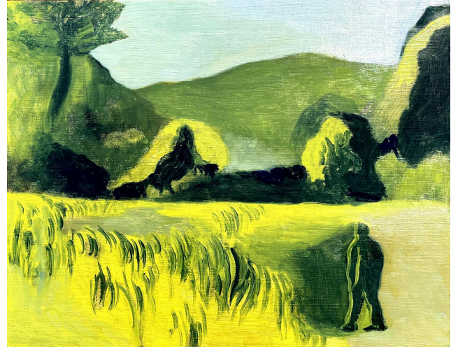
Dov Talpaz, Mountain Energy , 2021 Oil on wood, 11 x 14 in. $ 3,500