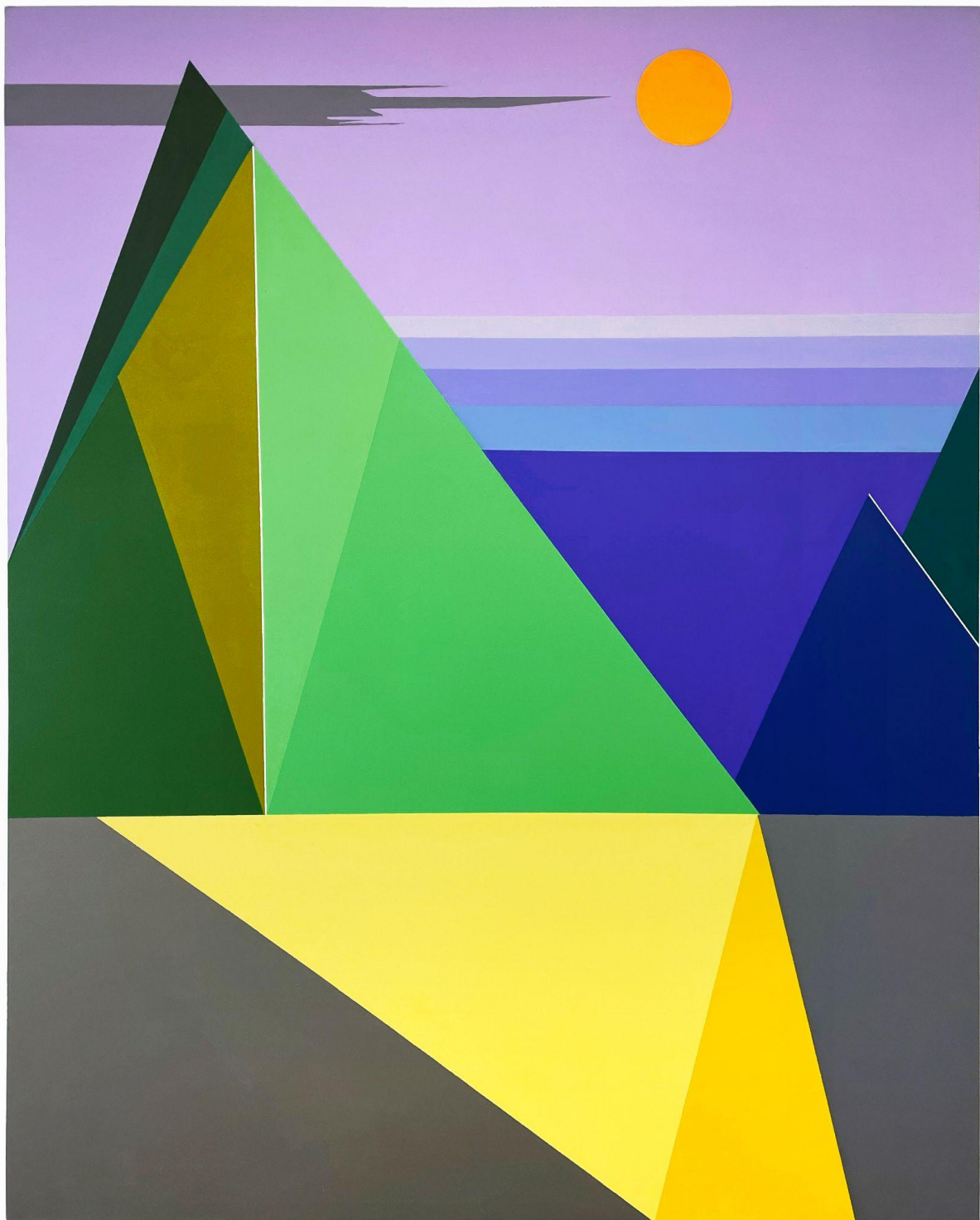
Dov Talpaz, Improvisation: Light , 2021-11, Latex on wood, 60x48 in. $ 15,000