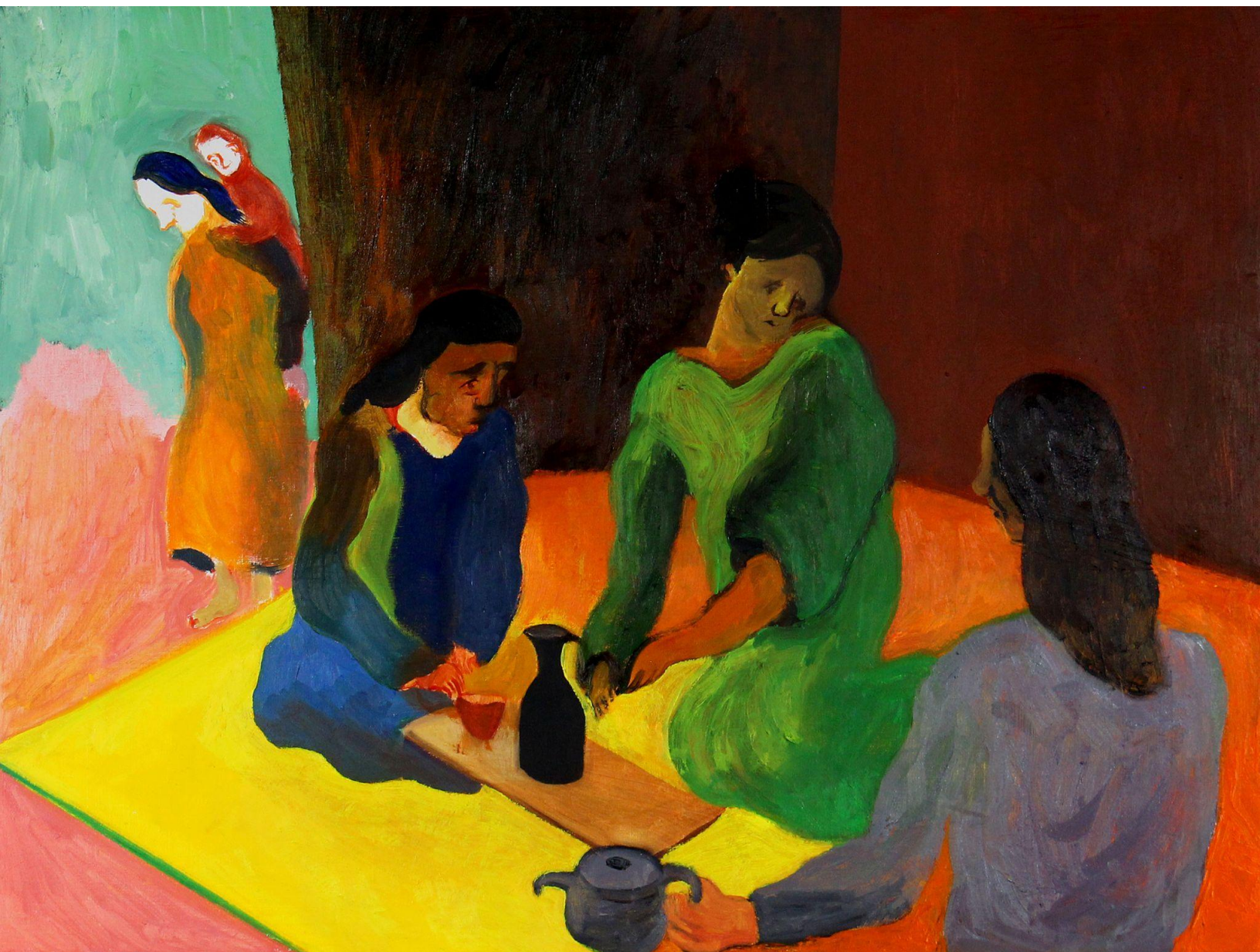
Dov Talpaz, Ugetsu , 2021, Oil on wood, 18x24 in. $ 4,500

The Flat - Massimo Carasi | www.carasi.it | theflat-carasi@libero.it | IG @theflat_massimocarasi