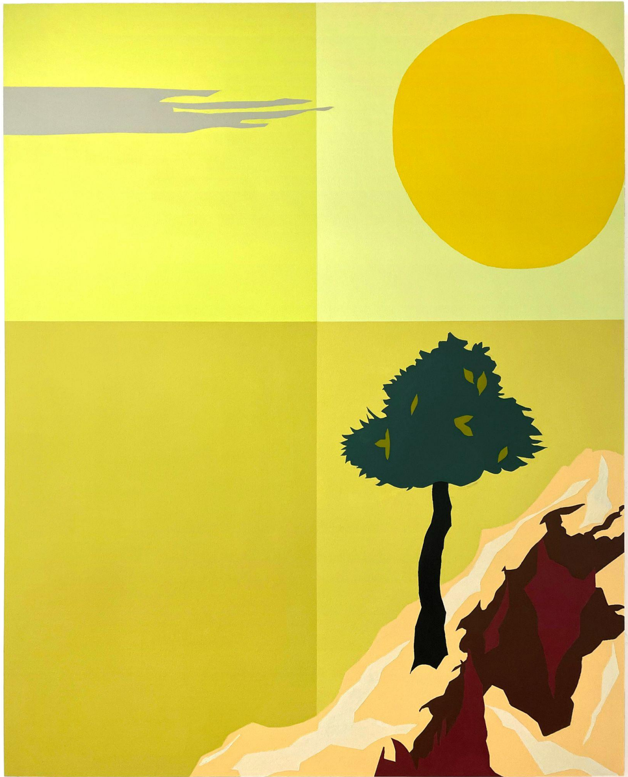
Dov Talpaz, Oasis , 2021-22, Latex on wood, 60x48 in. $ 15,000

The Flat - Massimo Carasi | www.carasi.it | theflat-carasi@libero.it | IG @theflat_massimocarasi