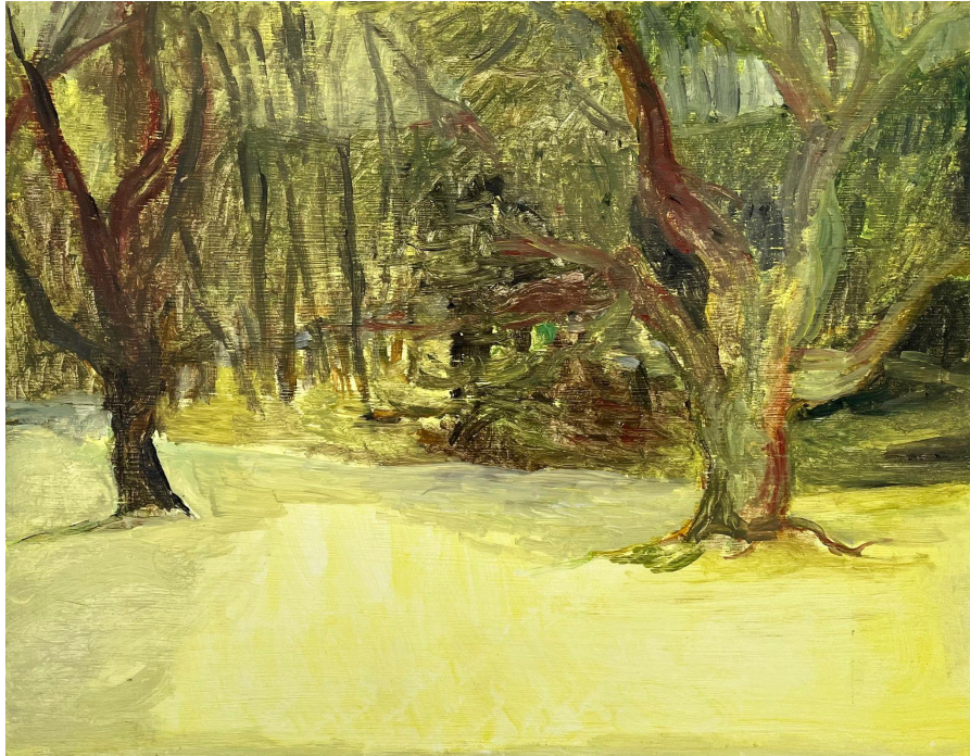
Dov Talpaz, In Between Trees , 2021, Oil on wood, 11 x 14 in. $ 3,500