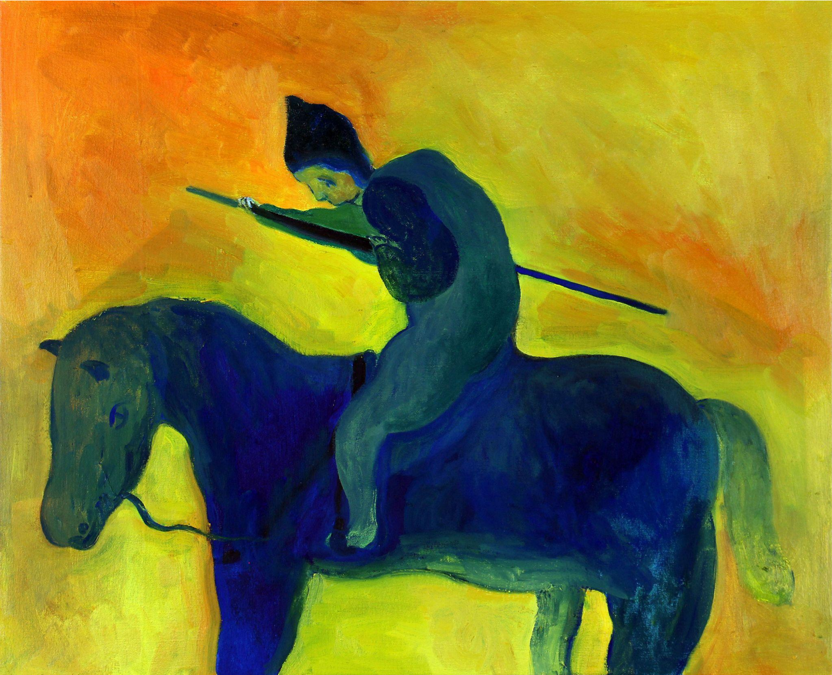
Dov Talpaz, Conquering Fear , 2020, Oil on canvas, 20x24 in. $ 4,500