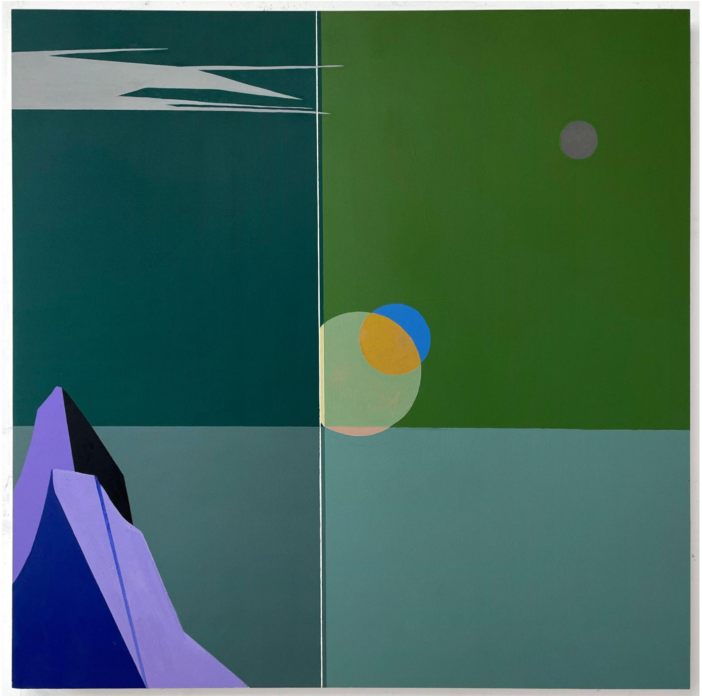
Dov Talpaz, Symbiotic Nature I , 2019-22, Latex on wood, 40x40 in. $ 12,000